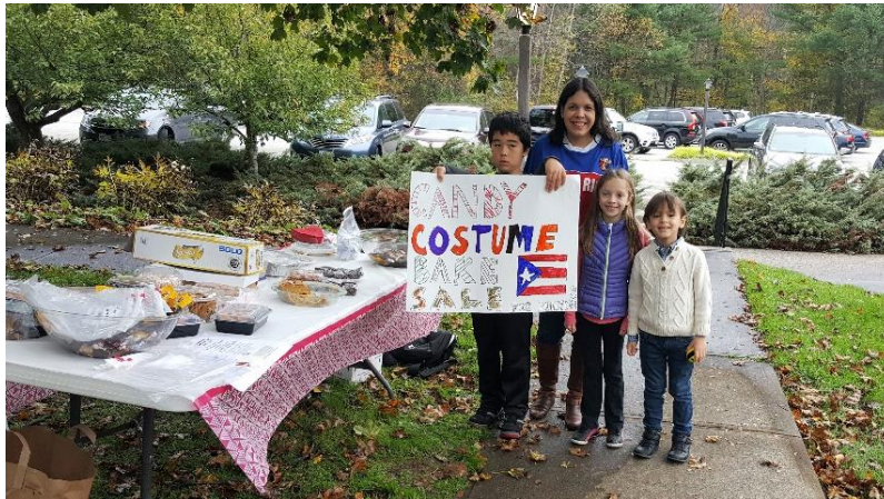
Fundraiser for Puerto Rico at St Irene's

Pedro y San Pablo parish from Utuado, Puerto Rico sent a thank you card and said they have started reconstruction of the parish. The other parish, Parroquia Inmaculado Corazón de María, in Las Marías, reports that they have used the funds to buy food, personal hygiene products, beds, and construction materials. Thank you to all, who contributed! Please continue to pray for our brothers and sisters in Puerto Rico and help them rebuild in any way you can.