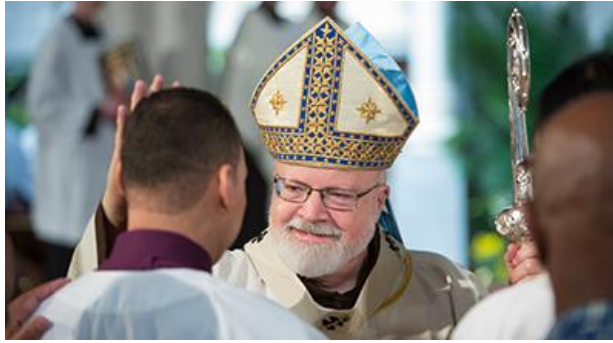
Cardinal Sean O'Malley of the Archdiocese of Boston

You can follow our results shared by the Archdiocese in ' 2018 Catholic Appeal Results '. So far St Irene is behind most parishes in percent goal completion, so please consider an Easter time pledge to catch us up.