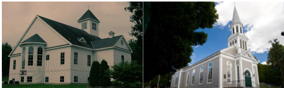
St Irene & Holy Family